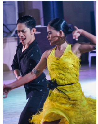
PHOTO COURTESY OF AN SULOG REIGNING DANCE POWER HOUSE. OCC retains their dance sports supremacy as they once again dominated the dance sports competition last night.

“They met my expectation based on the practice, it really